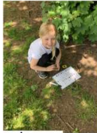
KS1 Bug and Bird Club